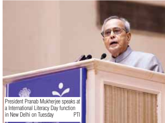
President Pranab Mukherjee speaks at an International Literacy Day function in New Delhi on Tuesday

President Pranab Mukherjee stressed on the need for greater 'societal involvement' in achieving higher literacy target and reminded of the UNESCO slogan of 'each one teach one', saying by adopting such strategy, 'it will be possible for us to fulfil the dream of Sakshar Bharat, Swachh Bharat and the Bharat of our dream'