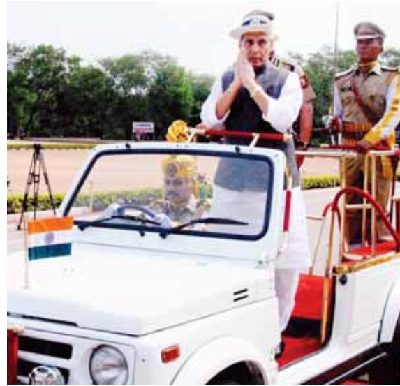
Union Home Minister Rajnath Singh reviews passing out parade at National Industrial Security Academy Parade Ground in Hyderabad on Tuesday

Police Forces (CAPFs), I believe if any force which will be the first to achieve the target of implementing 33 per cent reservation for women, it will be CISF," Singh said. The Home Minister added that in the era of globalisation and liberalisation, the role of CISF, tasked to